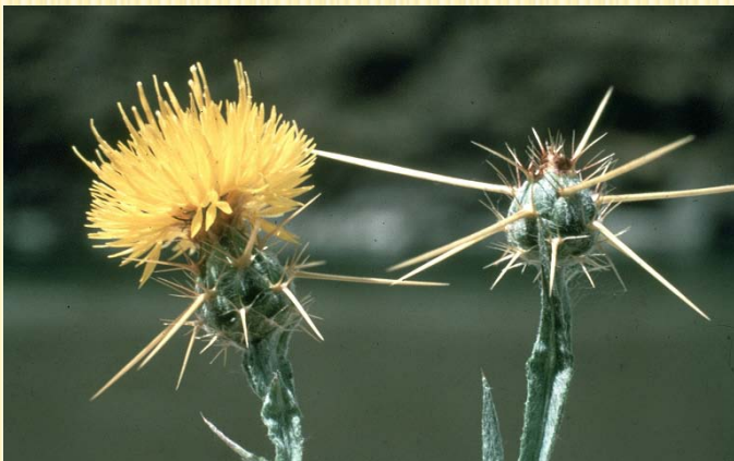
Yellow starthistle, Priority 1A species