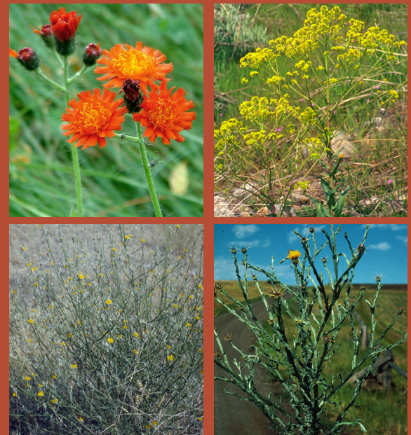
(Clockwise from top left) Orange hawkweed, dyer's woad, rush skeletonweed, and yellow starthistle are just four of the target species in the Missouri River Watershed states.

The MRWC-EDDMapS homepage includes links to distribution maps, online species reporting, species information, tools and training resources, and the My EDDMapS feature.