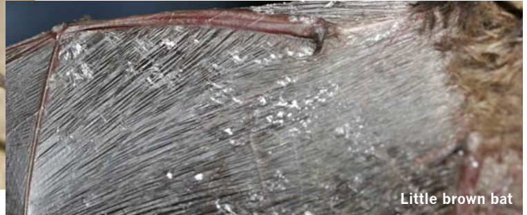
Little brown bat

Department of Defense (DoD) installations house populations of three Federally listed bat species along with many of the more common bat species. At the time of listing for these three species, human disturbance and its associated impacts was identified as one of the primary threats to these species. Initial conservation efforts involved modifying human activities to minimize anthropogenic impacts (e.g., gating caves and abandoned mines to limit disturbance at roost sites and closing caves to human access in winter to reduce impacts during hibernation). These and other measures were proving to be effective in many circumstances, and populations of listed species were showing improvement through the 1990s and early 2000s. The emergence of a novel wildlife disease, white-nose syndrome (WNS), has reversed the progress made by many populations of listed hibernating bats, devastated populations of common bat species in eastern North America, and altered the conservation landscape for hibernating bats as we have come to know it. At the time of this writing, WNS is now considered by many to be the biggest threat to hibernating bat species in North America.